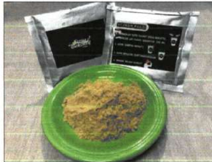
Figure 1: Samples of rice bran milk

one panelist in an organoleptic testing booth. Panelists were given an explanation of the assessment forms and other important matters when conducting organoleptic tests. Panelists were asked to write a hedonic scale response on the form provided by ticking the box according to the feeling he felt/assessed. In taste testing, panelists are sure to always drink water before moving from one formula to another in giving an impression.